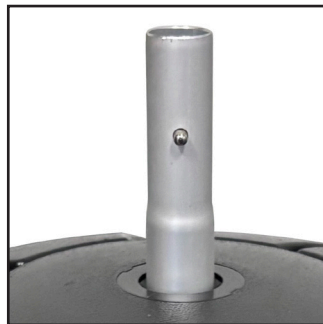
Spigot attached to base