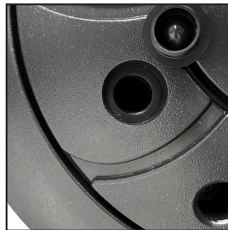
Hole with Screw-on cap